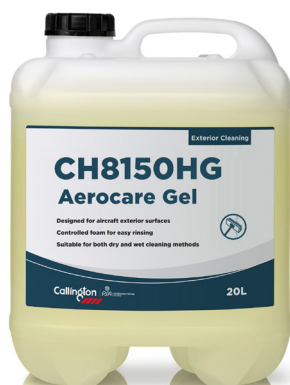
CH8150HG Eco-friendly exterior cleaning gel