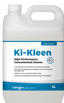
Ki-Kleen High performance surface cleaner

Global access to certified products across six continents