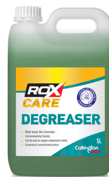
ROX® Care Degreaser Quick action heavy duty degreaser