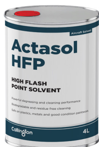
Actasol HFP Biodegradable cleaning solvent