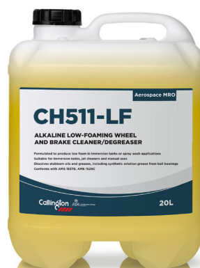
CH511-LF Alkaline low-foaming parts cleaner