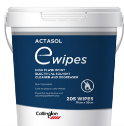
Actasol EWipes High flash point solvent cleaner & degreaser wipes