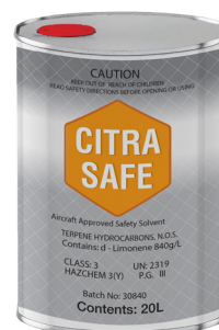
Citra-safe® Biodegradable non hazardous cleaning solvent