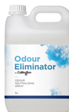
Odour Eliminator Ready to use odour neutraliser